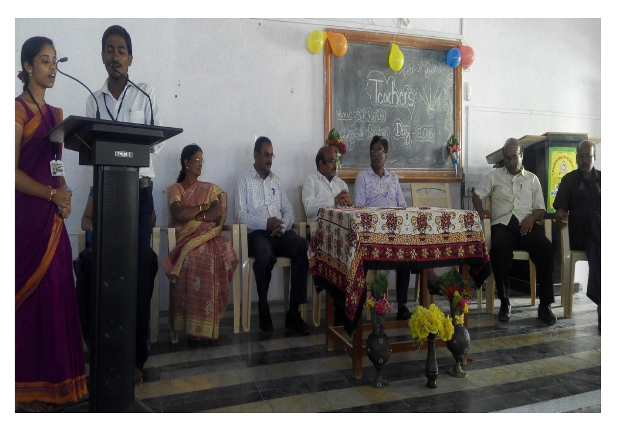
Shri Vijaymahantesh VidyaVardhak Sangh's